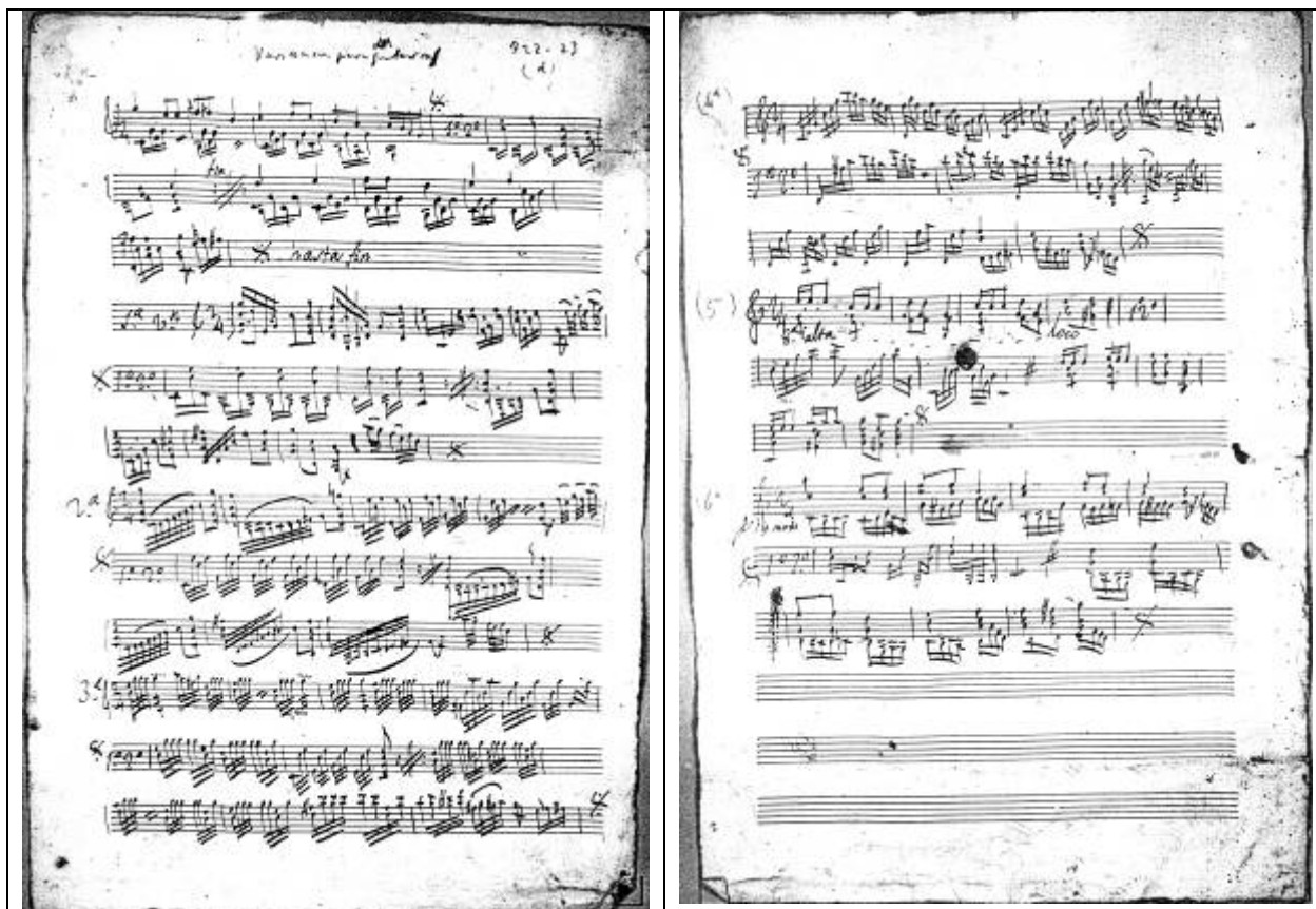
Variaciones para guitarra. Biblioteca Histórica Municipal de Madrid 722-24.