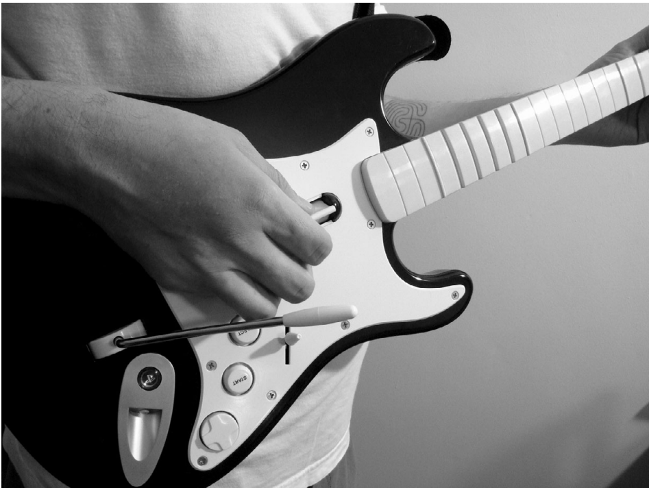
Figure 3. Strum bar, whammy bar (bends the pitch on sustained notes), and effects switch on the guitar controller body.