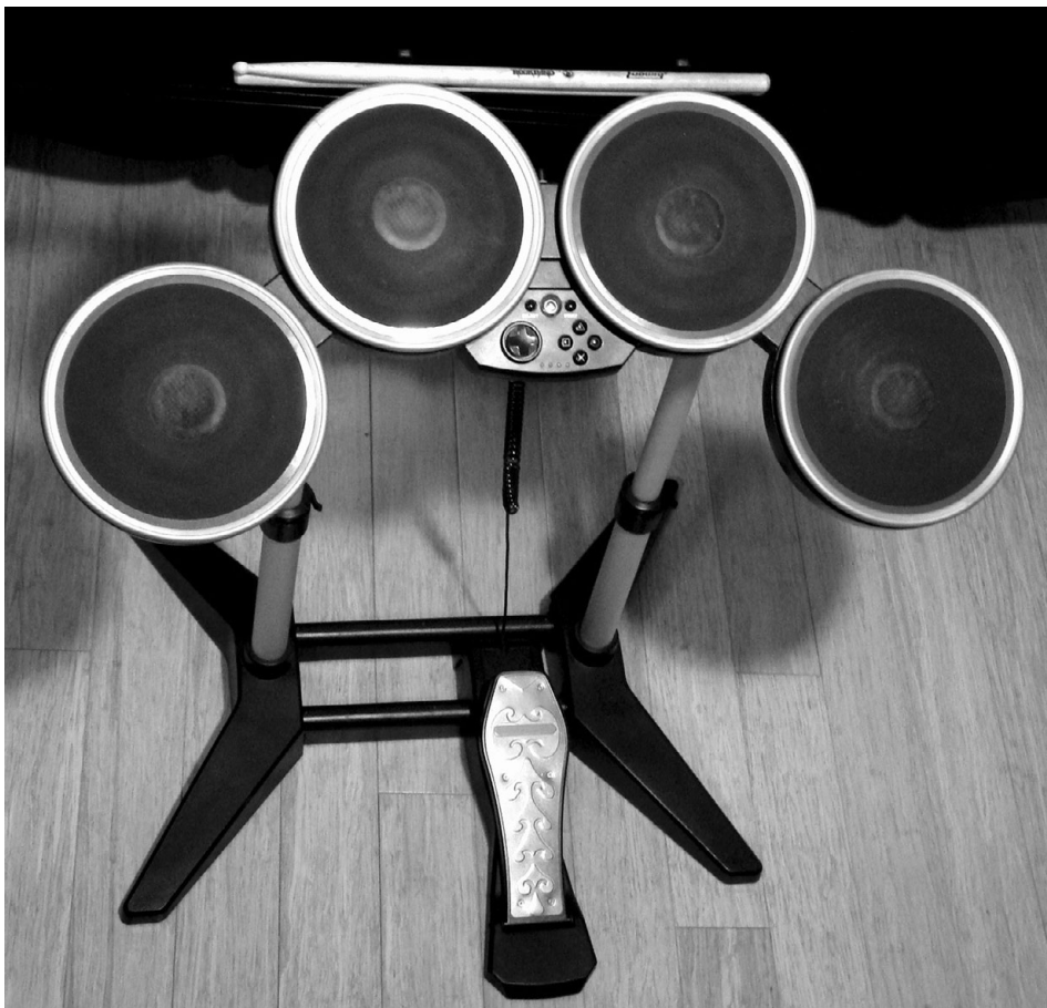
Figure 2. Drum controller for Rock Band .

likely with a melodic skip from BLUE to RED and stepwise motion from RED to GREEN. The player would also surmise that this notation is from a song being played at the “Hard” or “Expert” difficulty level, because it employs all five fret buttons. The “Easy” version of a guitar part uses only green, red, and yellow; “Medium” adds blue; “Hard” and “Expert” add orange. Because the player has only four fingers available for fretting, s/he must change hand positions when the notation requires all five fret buttons—a design decision that creates technical fingering puzzles for players to solve. As Dominic Arsenault notes in an article assessing Guitar Hero as a guitar simulator, there is “an emphasis on breadth and a deliberately limited depth” in the simulation; the designers’ apparent strategy was “to represent a little of everything.” 4