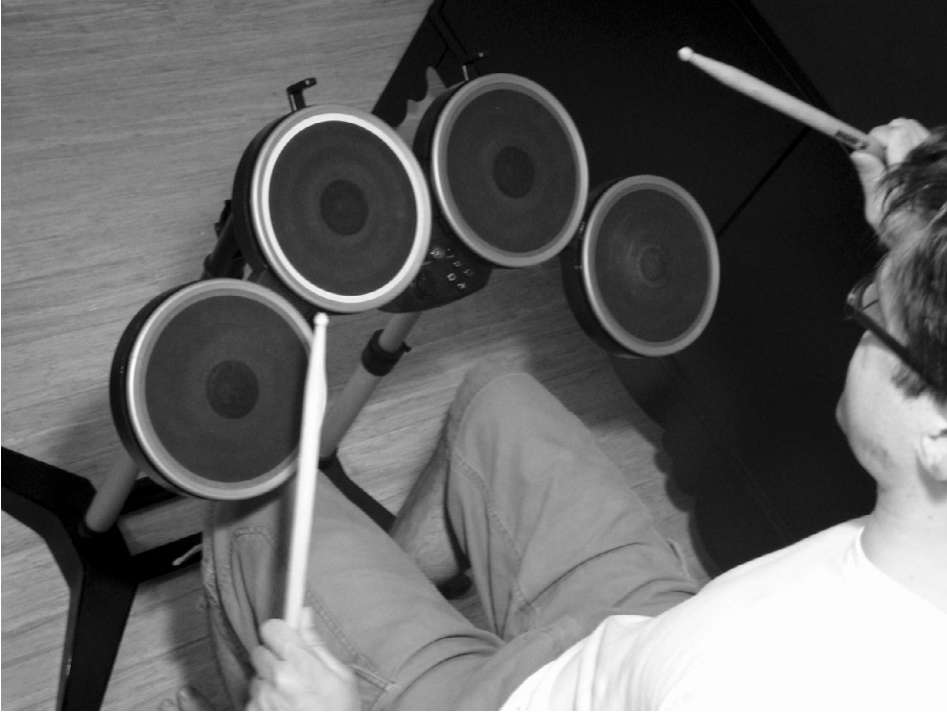
Figure 2. Continued.