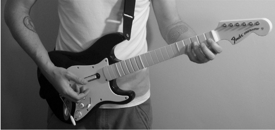
Figure 1. Guitar controller for Rock Band .

To play a song, a Guitar Hero guitarist must read the on-screen notation, simultaneously pressing a particular fret button with the left hand and a strum bar with the right hand (Figures 1, 2, 3, and 4). The player functions as the gatekeeper for prerecorded material; correct fretting/strumming allows each note to make its way from the game console to the speakers. If the player misses a note, that note drops out of the audio playback. (At the lower difficulty levels, a single on-screen note may correspond to a short riff on the recording.) At the borders of the streaming notation track, animated avatars perform the song in a rock club or arena. Frenetic camera angles and stage effects add to the excitement. A virtual crowd shouts praise to good players, boos incompetent players off the stage, and sometimes sings along.